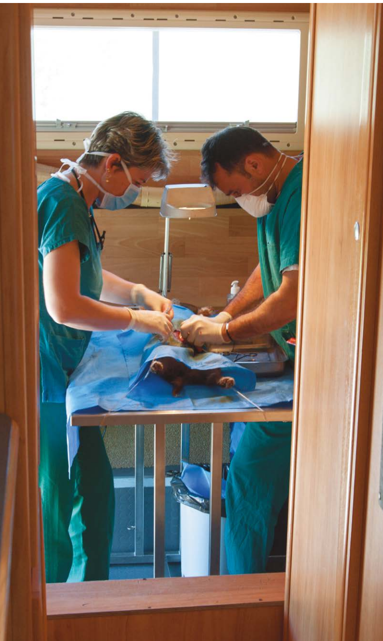
Mobile clinic: a dog is sterilised in the mobile clinic of Save the Dogs

support sterilisation campaigns. And because of the lack of private vet clinics in rural areas, local authorities should support mobile vet clinics run by NGOs.