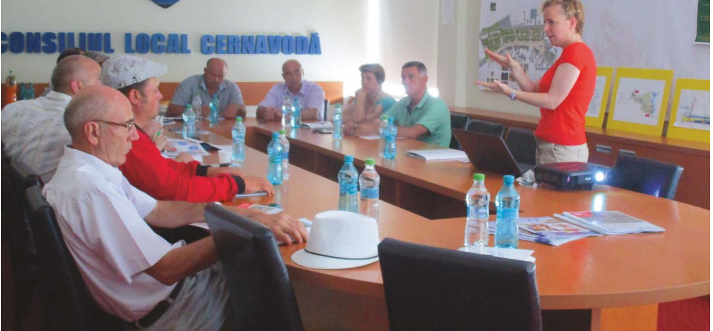
Dog population management: Meeting with (vice-)mayors from the region to present dog population management, June 2015

Euthanasia is carried out using anaesthetic + T61 injection by qualified and trained staff as this is the only licensed drug for euthanasia in Romania.